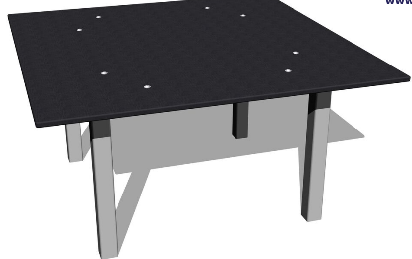
Table AG-103K - metal