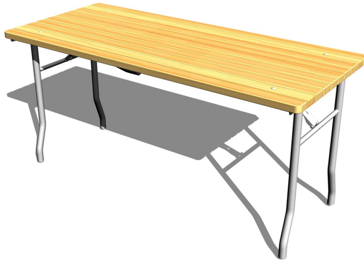
Table MILA for adults LAV0306ZD (folding)